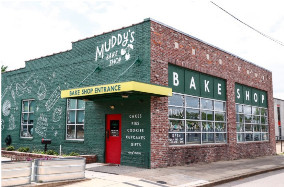
Muddy's Bake Shop opened in Sanderlin Centre in 2008.